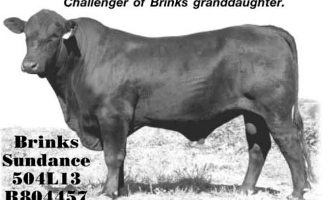
Brinks Sundance 504L13 R804457

BW 0.6 • WW 13.6 • YW 25.7 • Milk 20.6 • MAT 27.4 • REA 0.55