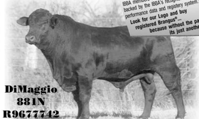
DiMaggio 881N R9677742

BW 1.8 • WW 16 • YW 21.9 • Milk -3.6 • MAT 4.4 Semen Available, contact Bovine Elite 800-786-4066